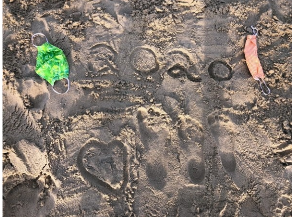
The Rowleys - having fun on the beach and with each other